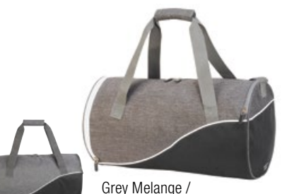
Grey Melange / Black / White