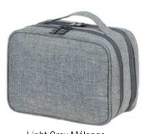
Light Grey Mélange